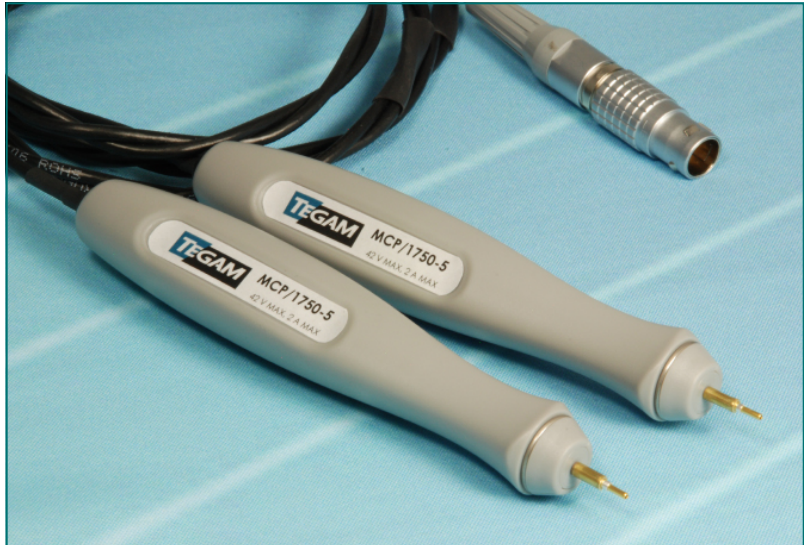
MCP/1750-5 Probe with Coaxial Pins Installed