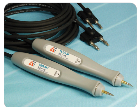
TEGAM BKP-10 Kelvin probes used to measure contact resistance between shunt and circuit board trace

Power is from internal rechargeable NiCad cells, and/or 110/220 VAC, 50/60 Hz power line. Power consumption is less than 10 W. The battery charges any time the line cord is plugged into a power receptacle. Battery charge time, from a discharged condition, is less than 8 hours for a full charge. Battery charge lasts for 140 operating hours maximum, and typically 60 hours.