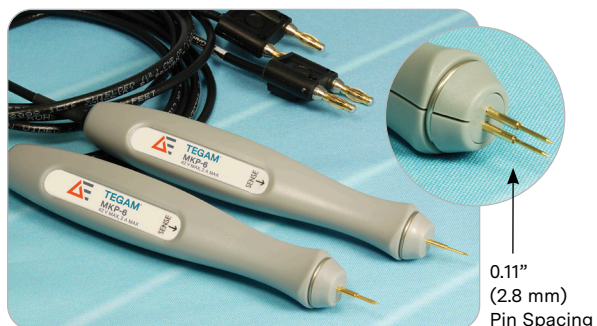
MKP-6 Probe Set with "B" Style Pins Installed