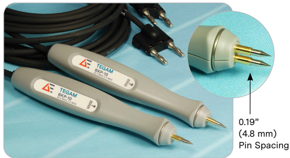
BKP-10 Probe Set with "B" Style Pins Installed