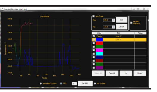
Display of Several Measurement Lines