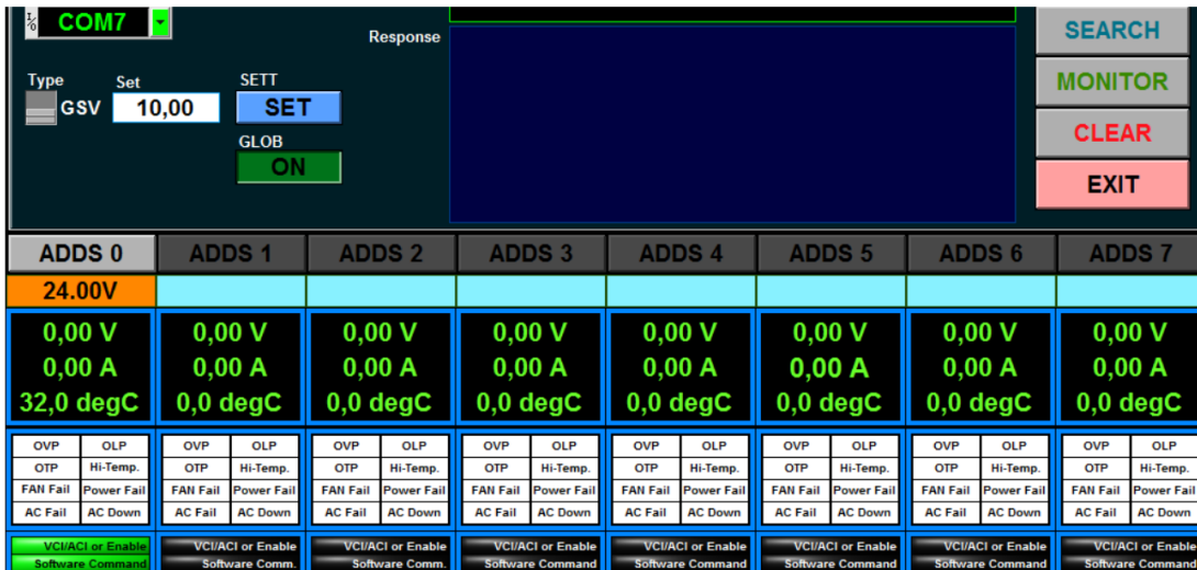
Figure 3: : GUI, 24 V TF Series power supply connected to ADDS 0 at COM7 in remote mode (orange)