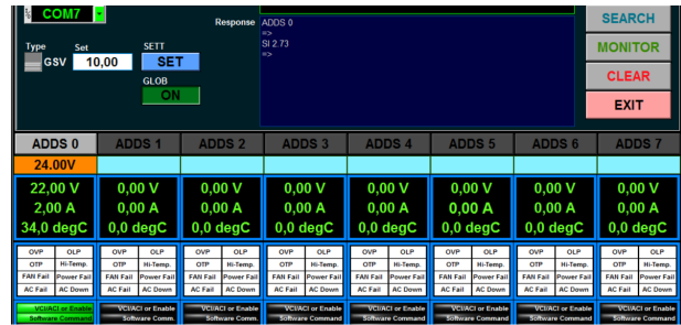
Figure 5: GUI, response to executed command “SI 2.73”