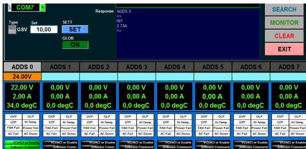
Figure 6: GUI, response to executed command “RI?”